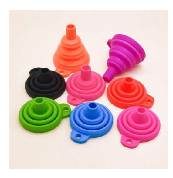
NH10064156 Sales 158