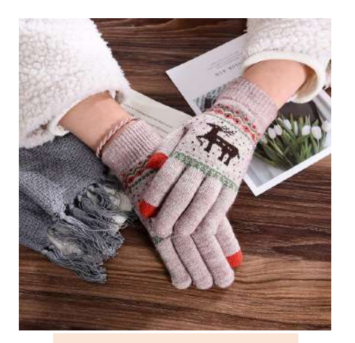
NH10088849 Monthly sales392