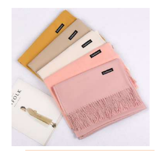
NH10079487 Monthly sales279