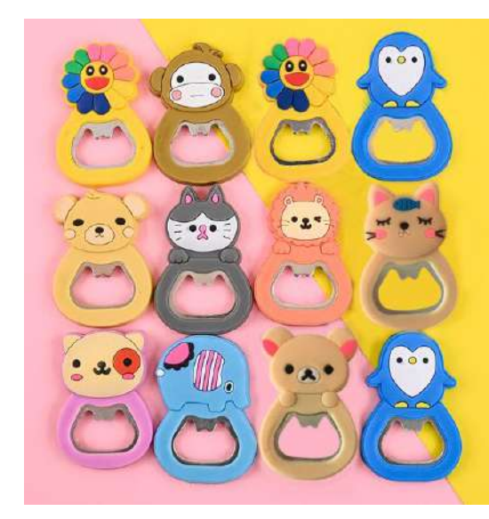
NH10101220 Sales 108