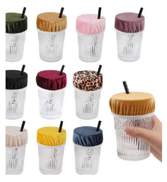
NH10087586 Sales 130