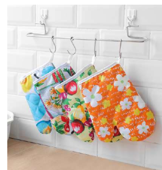
NH10083411 Sales 121