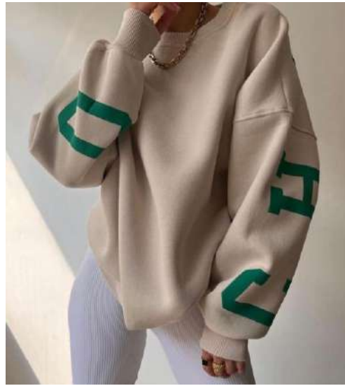
NH10101240 Sales 126