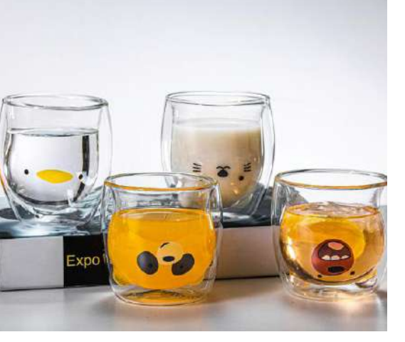
NH10055390 Sales 161