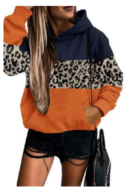
NH10077348 Sales 131