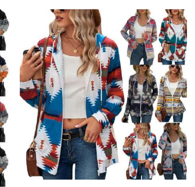
NH10092592 Sales 137