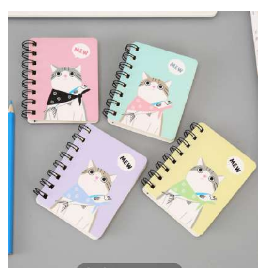
NH10090550 Sales 230