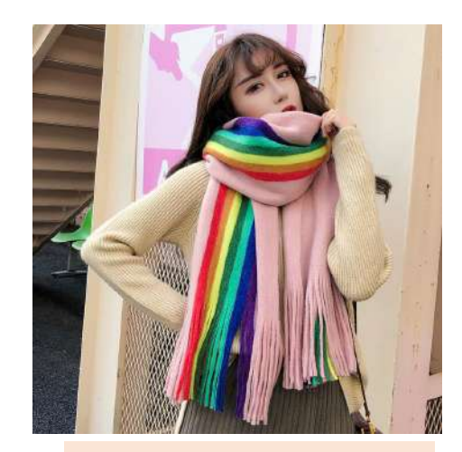
NH10096215 Monthly sales242