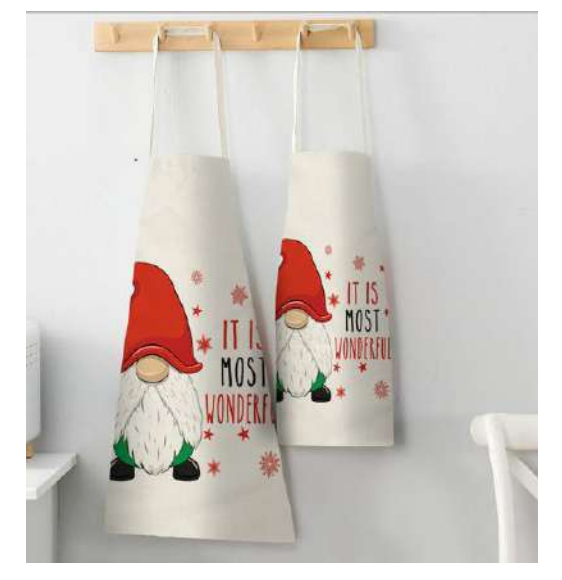
NH10030884 Sales 170