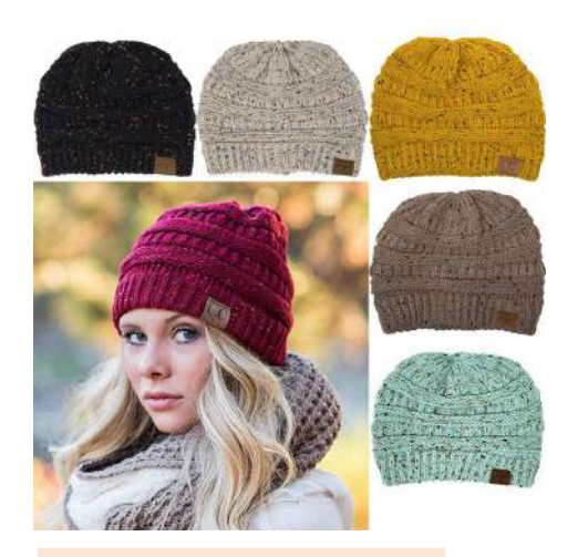
NH10086932 Monthly sales439