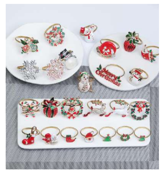
NH10078574 Sales 146