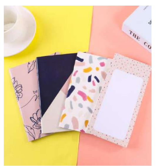
NH10090570 Sales 230