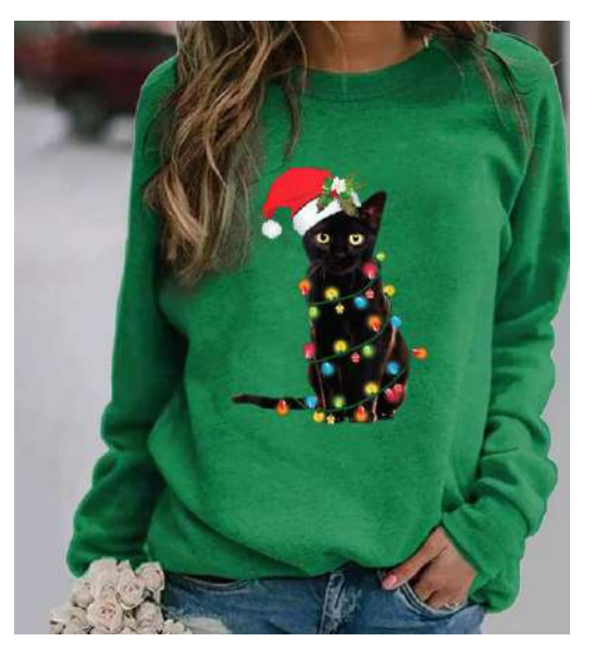
NH10060872 Sales 177